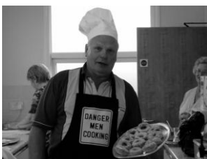
Anyone for freshly cooked doughnuts? Just one of the creative fundraising ideas used by Winter Gardens BC.

"Our vision is to see God's kingdom grow in the East of England through..."