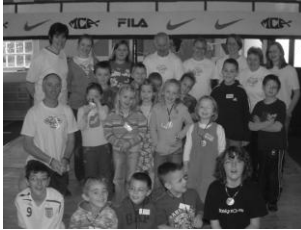
Children and Leaders from Norton Baptist Church at their Autumn Bible Holiday Club.